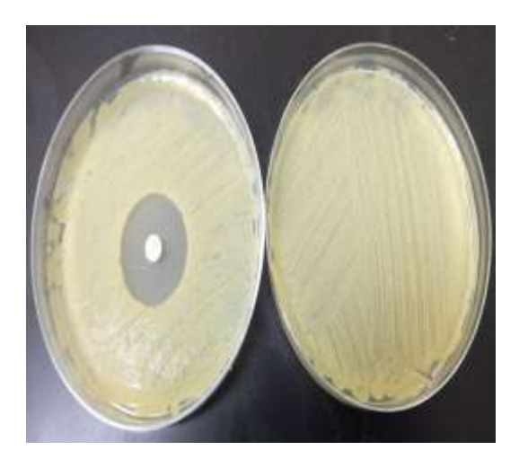
Figure.3 zone of inhibition using Agar disc diffusion method.