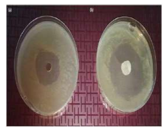
Figure.4 zone of inhibition using Agar well diffusion method.

with a sterile cork borer or a tip, and a volume (20– 100 mL) of the antimicrobial agent or extract solution at desired concentration is introduced into the well. Then, agar plates are incubated under suitable conditions depending upon the test microorganism. The antimicrobial agent diffuses in the agar medium and inhibits the growth of the microbial strain tested [13].