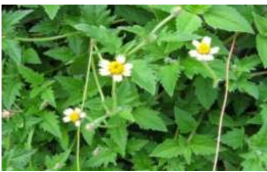
Figure.1 Tridax procumbens Linn

: Magnoliopsida : Asteridae : Asterales : Asteraceae : Tridax L : Tridax procumbens (L)